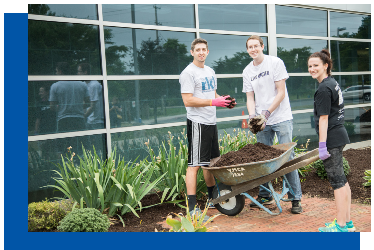
Employees at RKL volunteer during United Way's Day of Action.